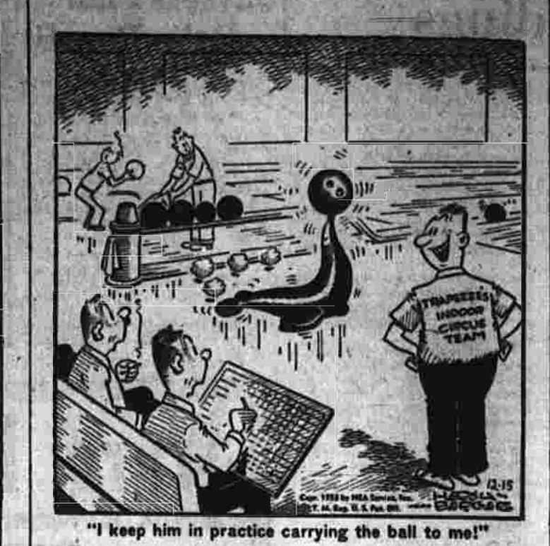
"I keep him in practice carrying the ball to me!"