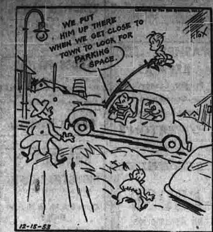
WE PUT HIM UP THERE WHEN WE GET CLOSE TO TOWN TO LOOK FOR PARKING SPACE.